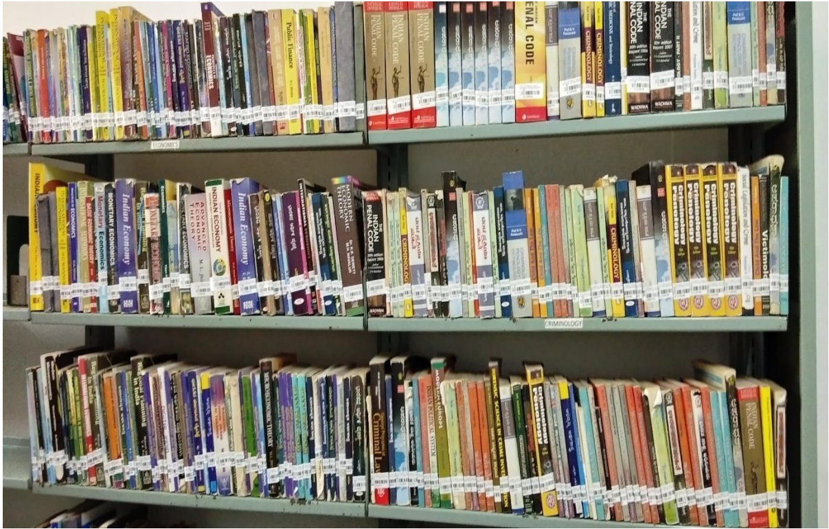
Collection of Books-Reference Section