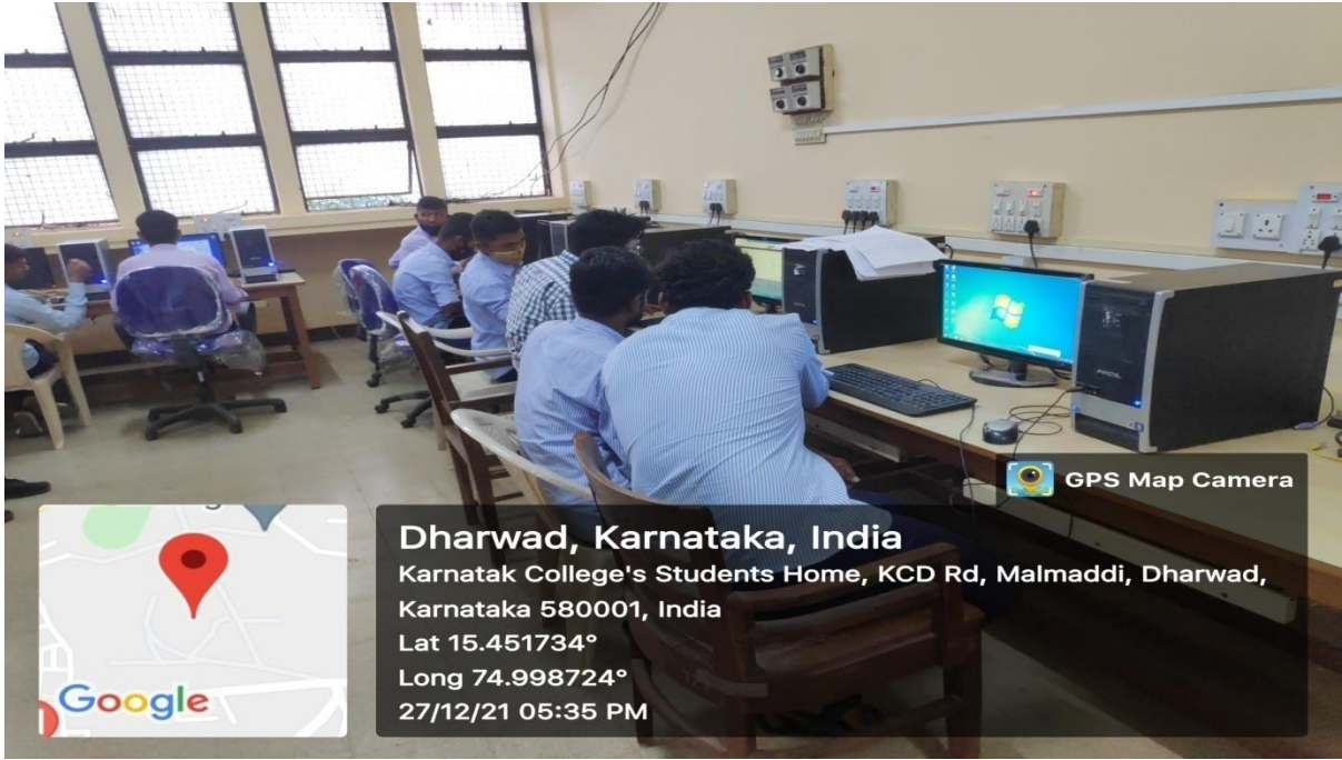
Browsing Centre for Students