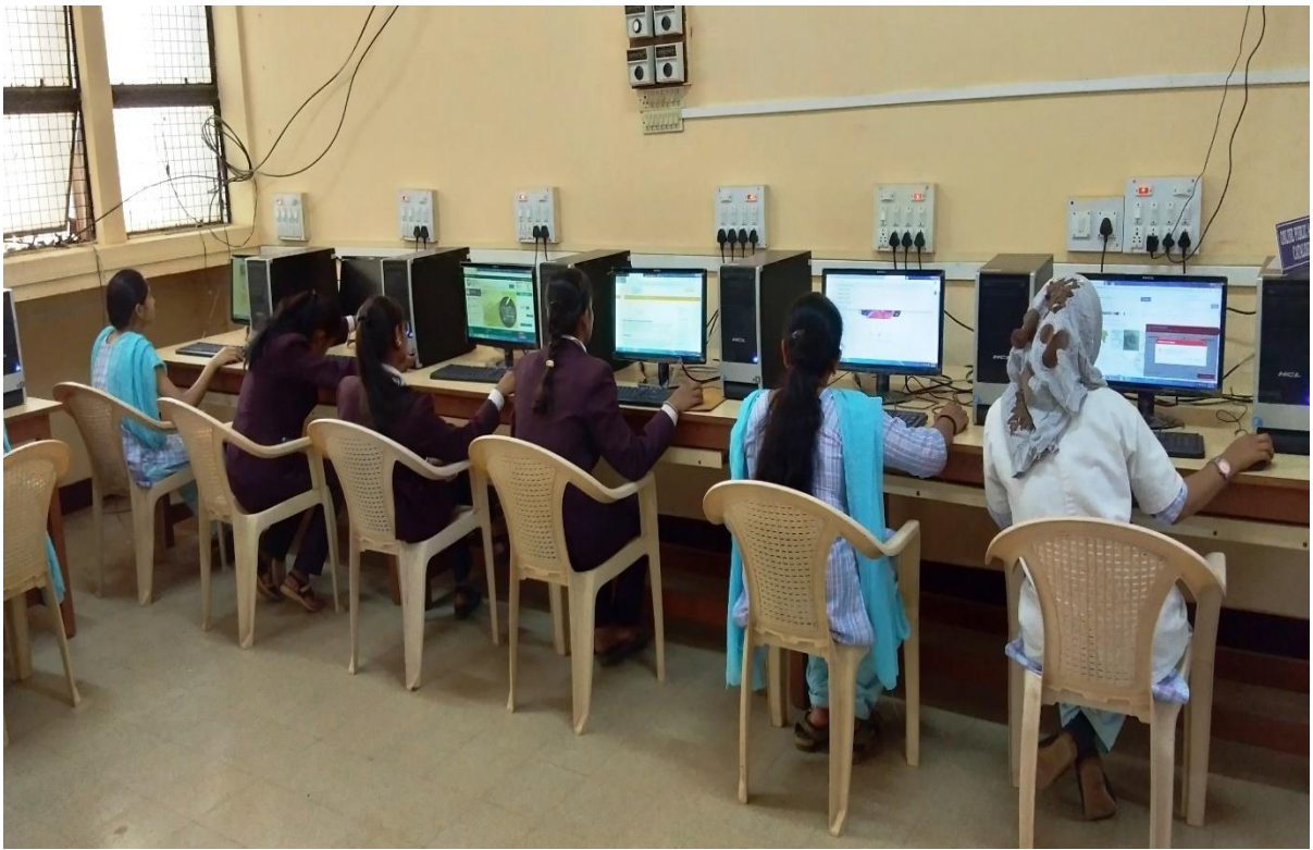
Online Access facility for students