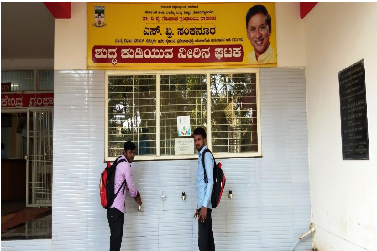
Reverse Osmosis (RO) drinking water facility for students and Staff at Dr.V.K.Gokak Library