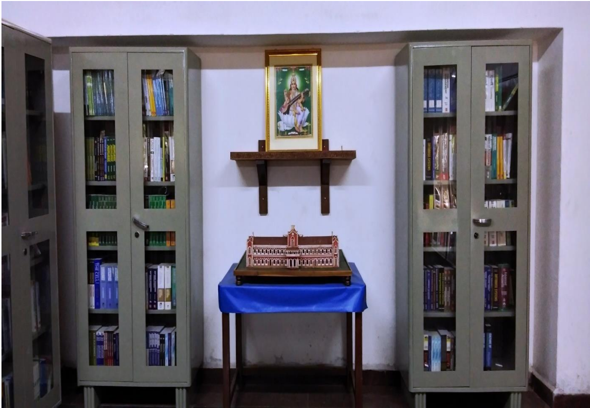
Collection of Rare Books