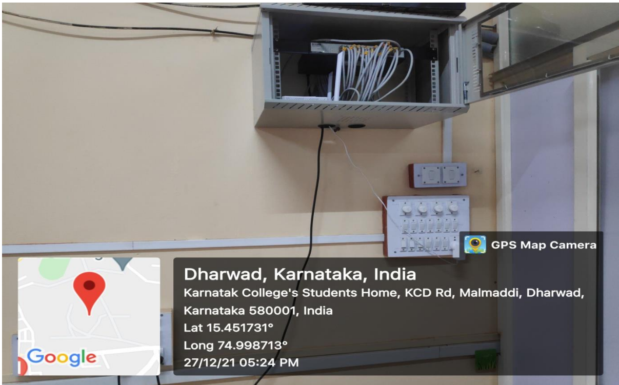
Wi-Fi distribution system