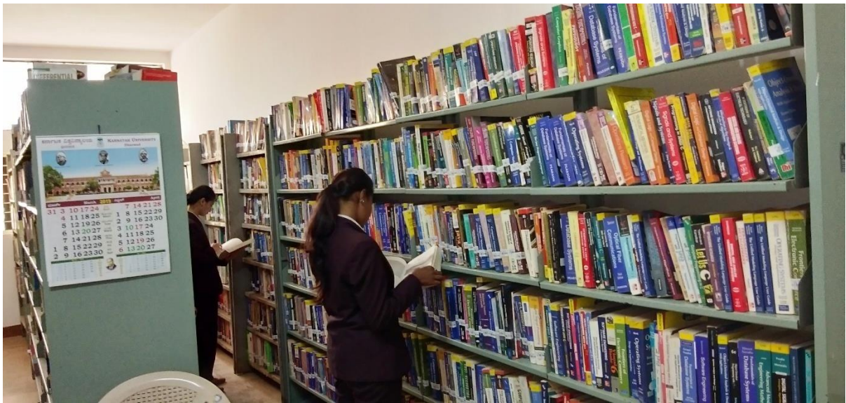
Collection of Books-Home Issue Section