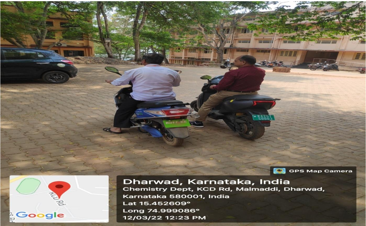
Staff members of the college using Battery-powered vehicles